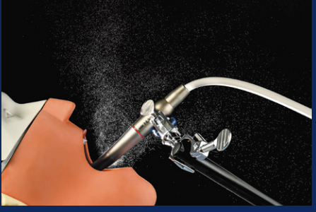
Contra-angle w/ spray air