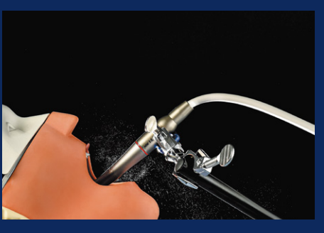
Contra-angle w/ NO spray air